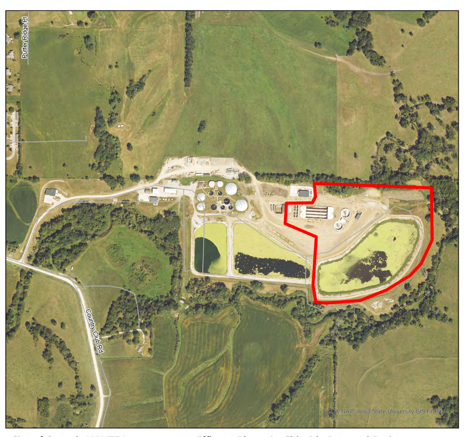
City of Osceola WWTF Improvements Effluent Phase 1 - Chloride Removal Project Osceola, IA (Clarke County)