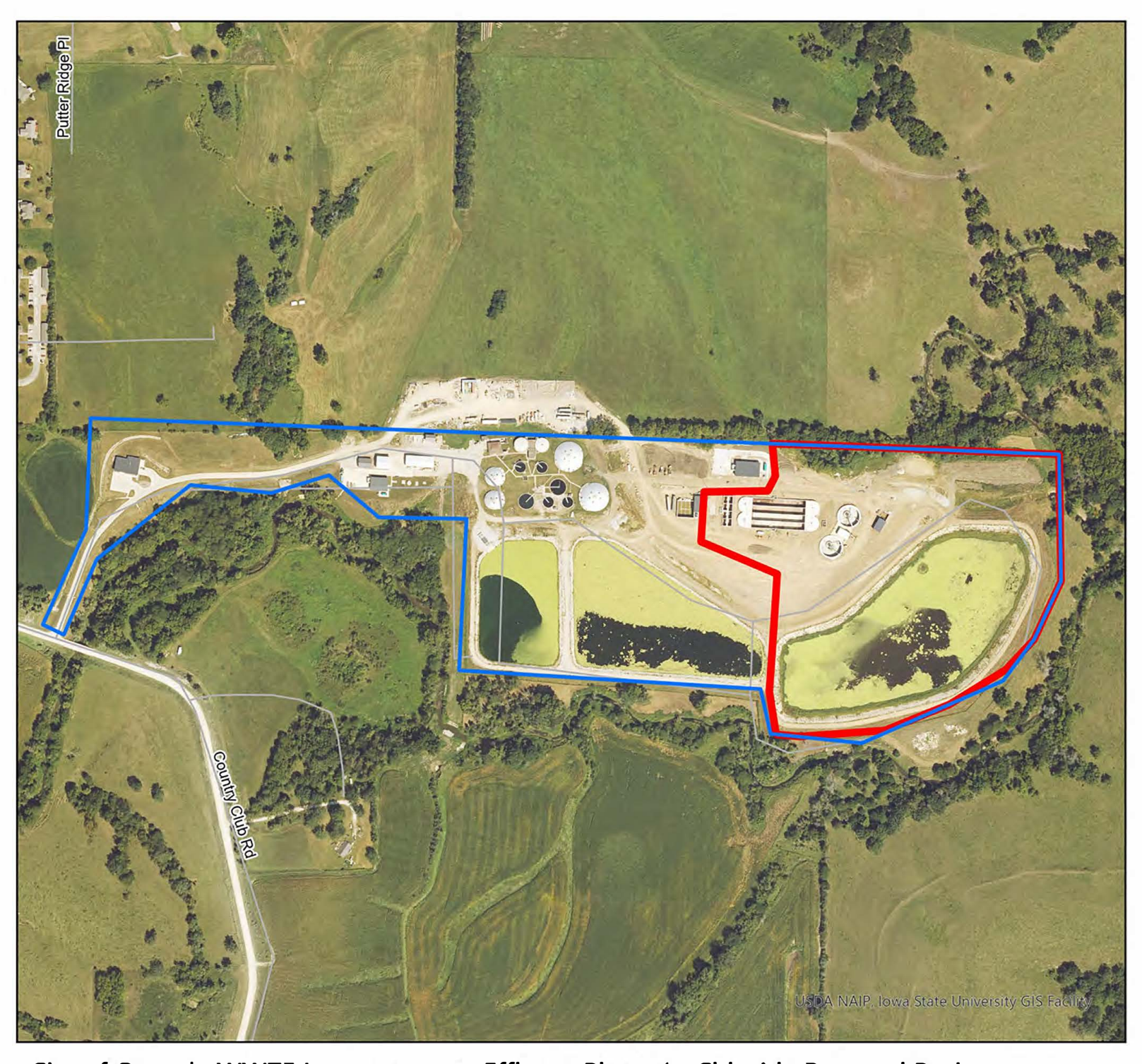
City of Osceola WWTF Improvements Effluent Phase 1 - Chloride Removal Project Osceola, IA (Clarke County)