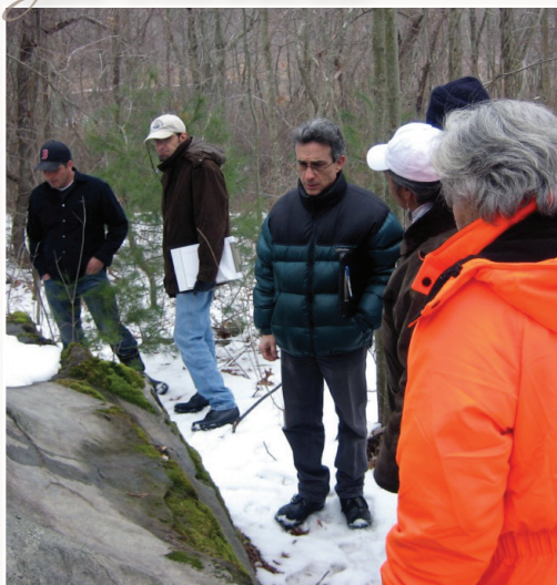
Section 106 consultation with an Indian tribe