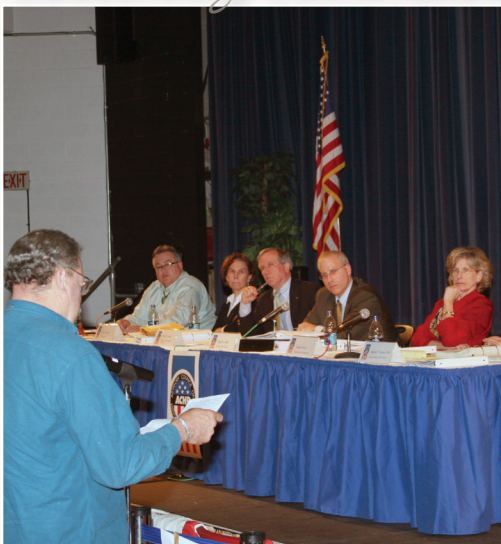
A panel of ACHP members listen to comments during a public meeting.