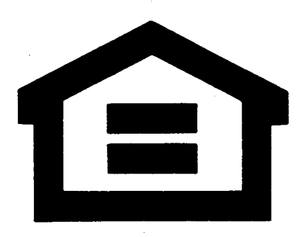
EQUAL HOUSING OPPORTUNITY